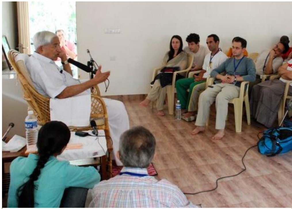
(above) Rev. Master at Malampuzha with scholars of STP 2008

SPURS: We include a report on SPURS retreat ranch at the close of 2008.