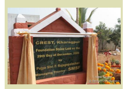
(above) Pictures from foundation stone laying event at CREST, Kharagpur