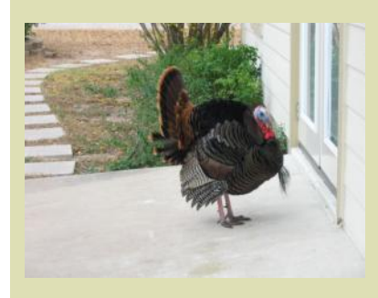
(above) Pictures from SPURS retreat ranch

The information on SPURS is available on the web at: <a href="http://www.sahajmarg.org/spurs">http://www.sahajmarg.org/spurs</a>.