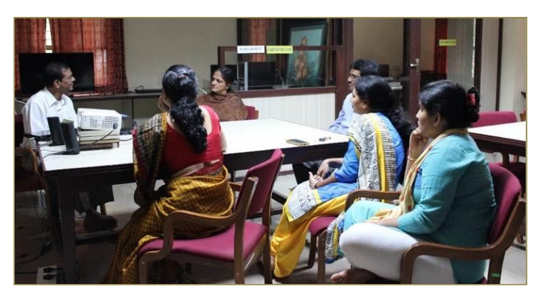
(above) Participants of the seminar 'Work Place Ethics'