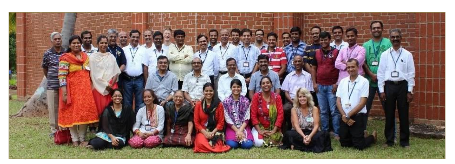
(aboue) Participants of the Heartfulness C-connect program