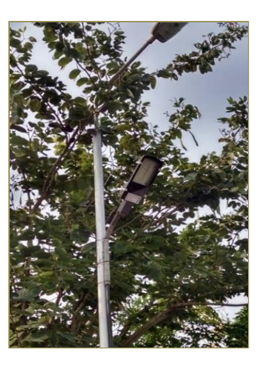
(above) LED lights installed in the Pune retreat center campus

Abhyasis who wish to apply for retreats either at the Malampuzha , Pune or Kharagpur centers may find more information about these facilities and the retreat program at: <a href="http://www.sahajmarg.org/smww/retreat-center-overview">http://www.sahajmarg.org/smww/retreat-center-overview</a>. Abhyasis who wish to enroll for retreat programs may now apply online at the address given above.