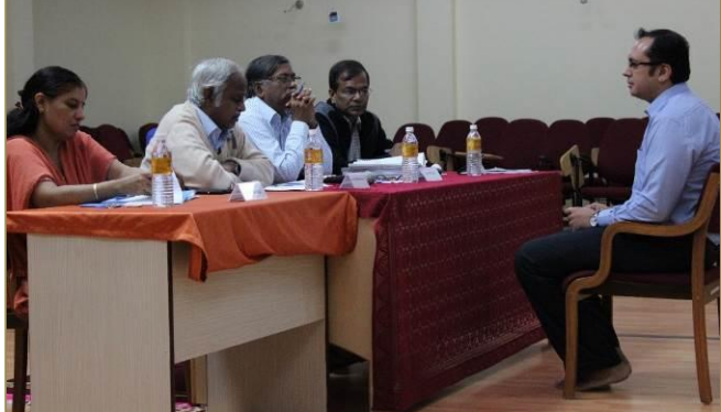
(above) Panel conducting examination of a research scholar during the University of Mysore course work