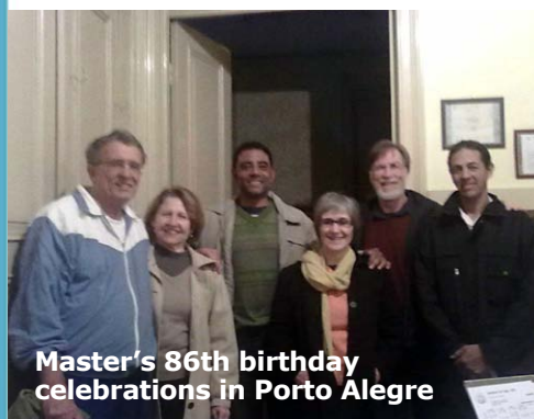
Master's 86th birthday celebrations in Porto Alegre