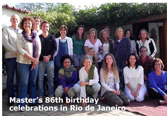
Master's 86th birthday celebrations in Rio de Janeiro