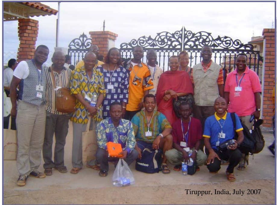
Tiruppur, India, July 2007

"Whispers from the Brighter World – p.64