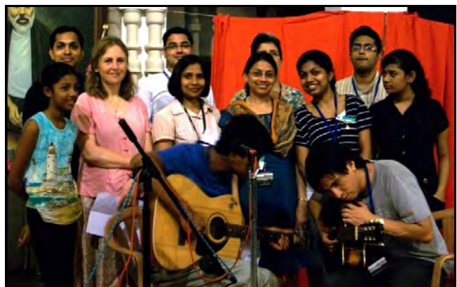
NZ singing group