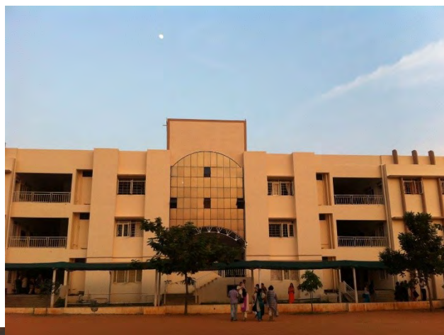
Main classroom block