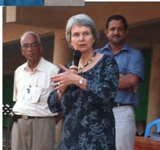
Value based education talk