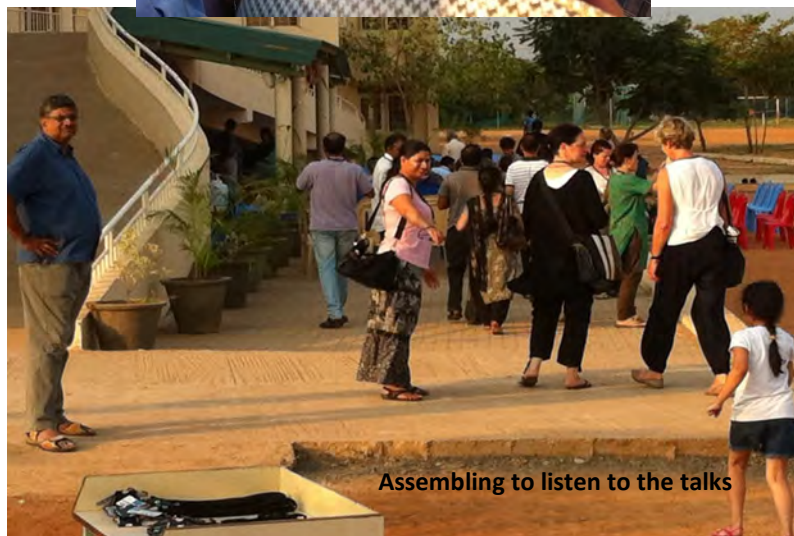
Assembling to listen to the talks

Please send articles to the editor ecrichton@optusnet.com.au . © 2010 Shri Ram Chandra Mission ("SRCM"). All rights reserved. "Shri Ram Chandra Mission", "Sahaj Marg", "SRCM", "Constant Remembrance" and the Mission's Emblem are registered Trademarks of Shri Ram Chandra Mission. This Newsletter is intended exclusively for the members of SRCM. The views expressed in the various articles are provided by various volunteers and are not necessarily those of SRCM.