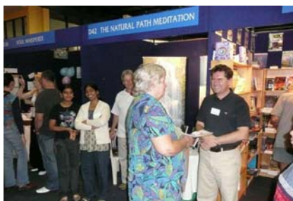
Mind Body and Spirit Brisbane