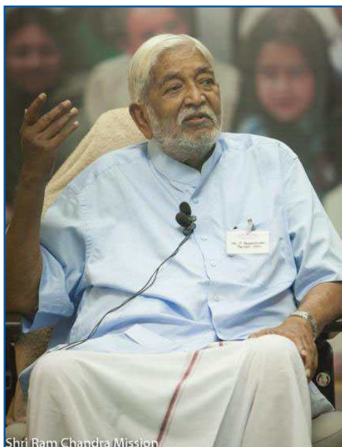
Shri Ram Chandra Mission